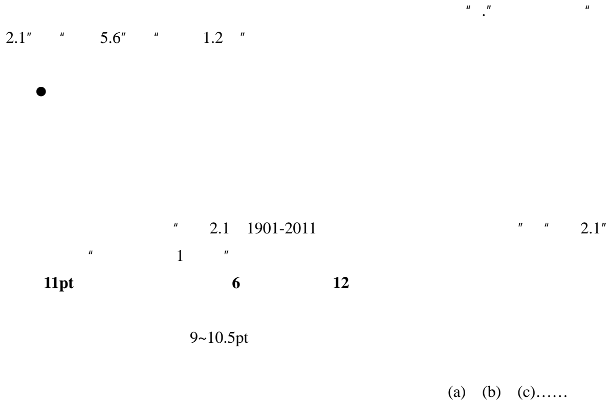
" Fig 2.1 Distribution of annual mean temperature Northwest China from 1901 to 2011"